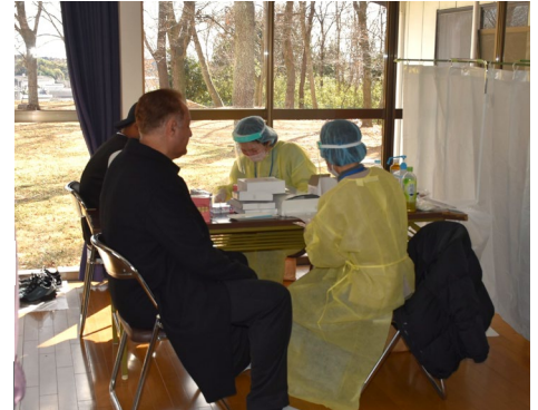
Medical Mission in Ibaraki Congregation of the Sacred Hearts of Jesus and Mary

(2) Checkup results will be given in July 2025.